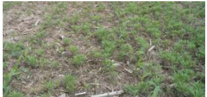
High density of horseweed plants in a young corn crop.

Horseweed seeds are relatively short-lived in the soil with most seeds not surviving more than three years. Seeds have very little dormancy and most will easily germinate when conditions are favorable, which is typically within the two germination windows mentioned above. Horseweed seeds will not germinate if buried deeper than 0.2 inches in the soil profile.