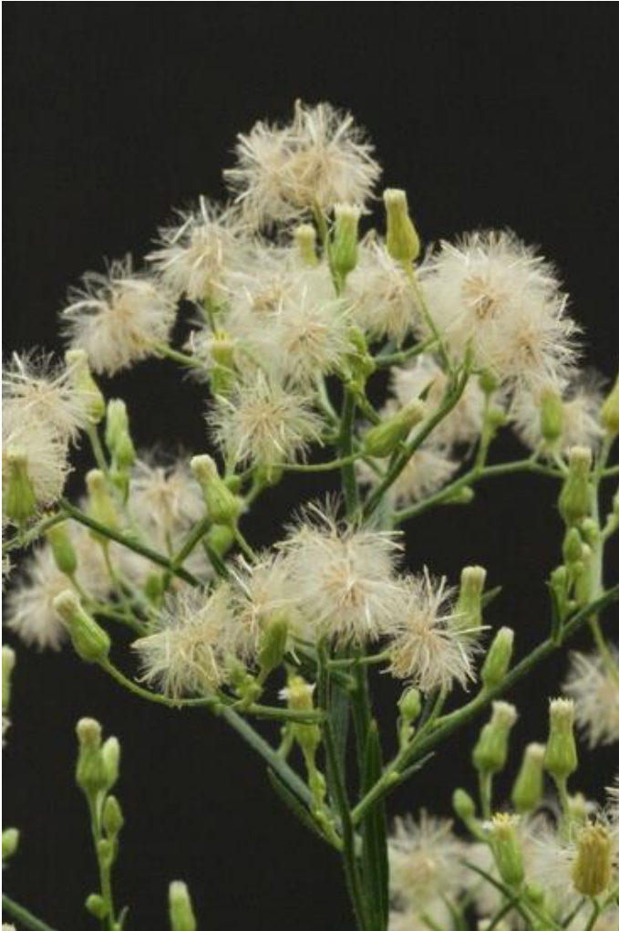
Horseweed seeds are easily dispersed due to their pappus. Image from the University of Missouri Weed Id Guide.

can also be dispersed by water or with human assistance on vehicles or farm equipment.