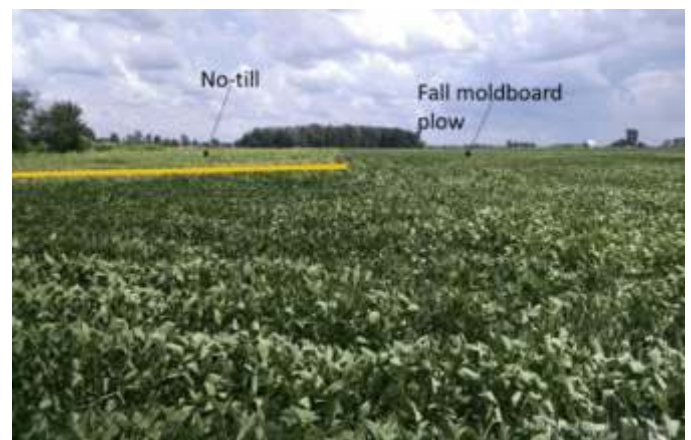
Photo: Difference in horseweed density by tillage type. The area of the field to the left was no-till and the field area on the right was moldboard plowed in the fall. Photo Credit: Paul Gross, Michigan State University.

While tillage can contribute heavily to horseweed management, in some instances tillage for weed management is not desirable because of potential trade-offs, such as cost or the reduction in erosion control. In those instances, there are alternative tactics that are effective for controlling horseweed.