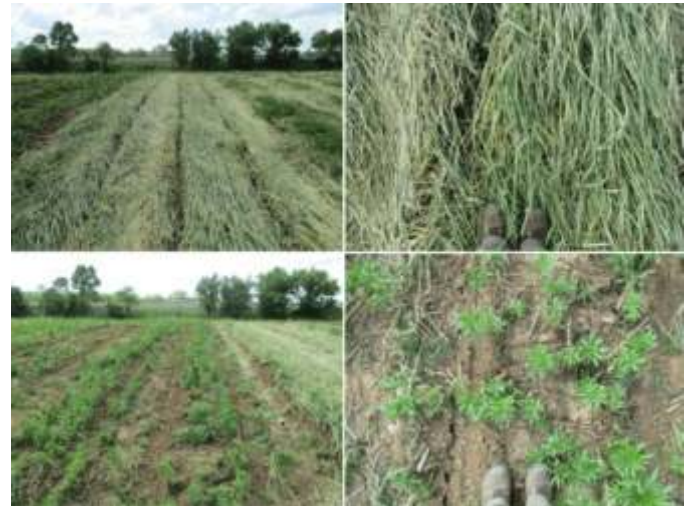
Horseweed density between cereal rye (top photos) and no cover (bottom photos) plots at soybean planting. The cereal rye was terminated with a roller-crimper two weeks prior to soybean planting.

Not only did cover crops reduce the number of horseweed rosettes, the size of the rosettes was reduced in the presence of cover crops compared to the no cover control. Where cereal rye was grown, most of the horseweed rosettes were less than 1.5” in diameter; in the no-cover check most of the weeds were 1.5 – 2.5” in diameter. The smaller size makes the rosettes more susceptible to a herbicide application.