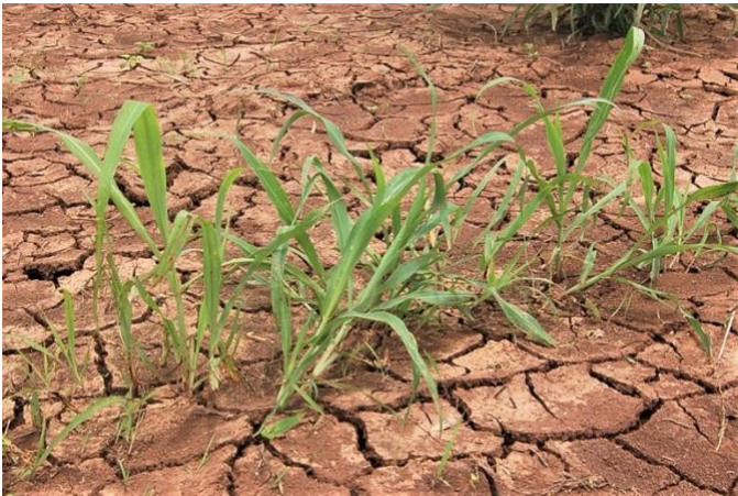
Emergence of johnsongrass shoots from rhizomes.