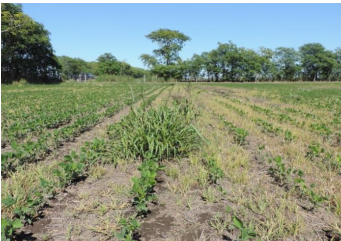
Glyphosate-resistant johnsongrass in a soybean field.