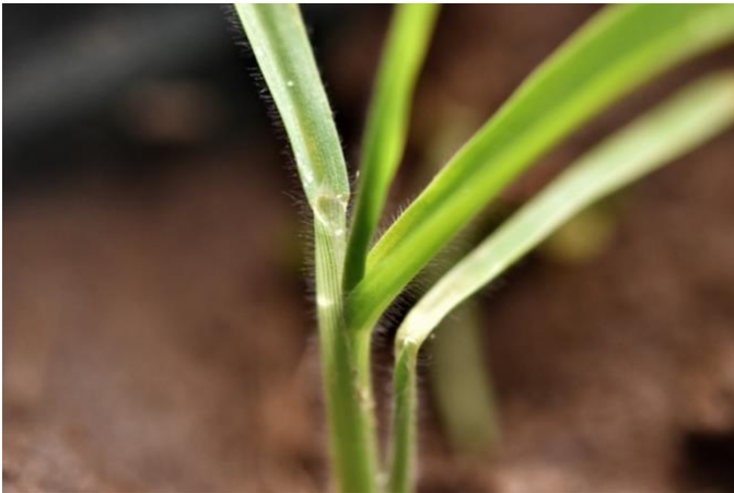
A close-up image of the fall panicum (notice fall panicum seedlings have hairs on the stem and leaves; johnsongrass seedlings lack hairs).