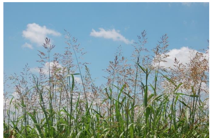
Johnsongrass at the reproductive stage.

Johnsongrass has two main forms of spreading. First, the seeds can shatter and spread; second, the plant produces long rhizomes, which spread vegetatively. Johnsongrass seeds generally fall close to the mother plant. Tillage can fragment rhizomes and assist spread. Rhizomes are somewhat drought tolerant and remain viable even after drying to 40% of their initial biomass. However, they are sensitive to extreme temperatures. Without soil disturbance, rhizomes generally spread slowly in a field. Johnsongrass dispersal across fields is typically facilitated by human activities, such as the movement of tillage, planting ( which spreads both seeds and rhizomes), and harvesting equipment (which spreads seeds).