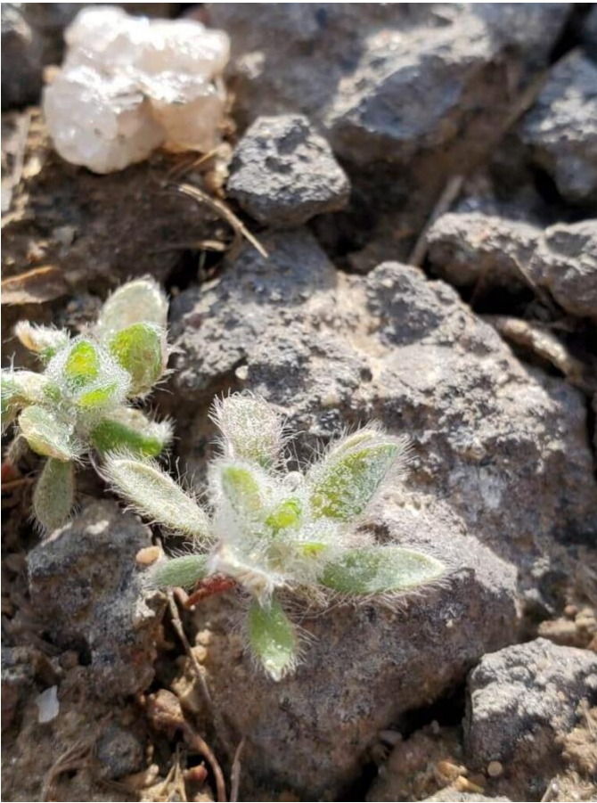
Kochia button stage with fine leaf hairs.

Around two weeks after seedling emergence, leaf hair density decreases as leaves grow. After the button stage, kochia leaves maintain fine leaf hairs on the bottom of the leaf, while leaf tops are smooth. It is common to see high seedling densities, especially around the location where the parent plant was growing before detaching from the soil when mature. This is often referred to as a “kochia mat.”