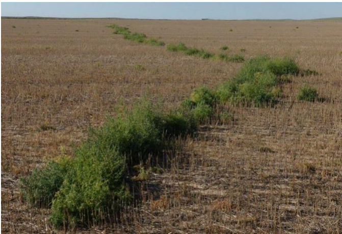
Resistance kochia streak.

especially during early critical weed free periods. Establishing competitive crops such as winter wheat has been shown to reduce kochia biomass in field studies by over 99% compared to treatments without wheat. Mowing kochia closer to flowering has been shown to reduce seed densities the following year by 98% and reduce biomass by 33% compared to a non-mowed control in a surface mining reclamation project. Chemical fallow is commonly used in the high plains, however the development of herbicide-resistance to commonly used fallow herbicides allows for maximum kochia growth and seed production in the absence of plant competition. Kochia that are able to grow in chemical fallow can rapidly spread a resistance trait through both seed and pollen dispersal. Resistance to glyphosate (RoundUp) is commonly seen in chemical fallow with the meandering trails of kochia throughout the field.