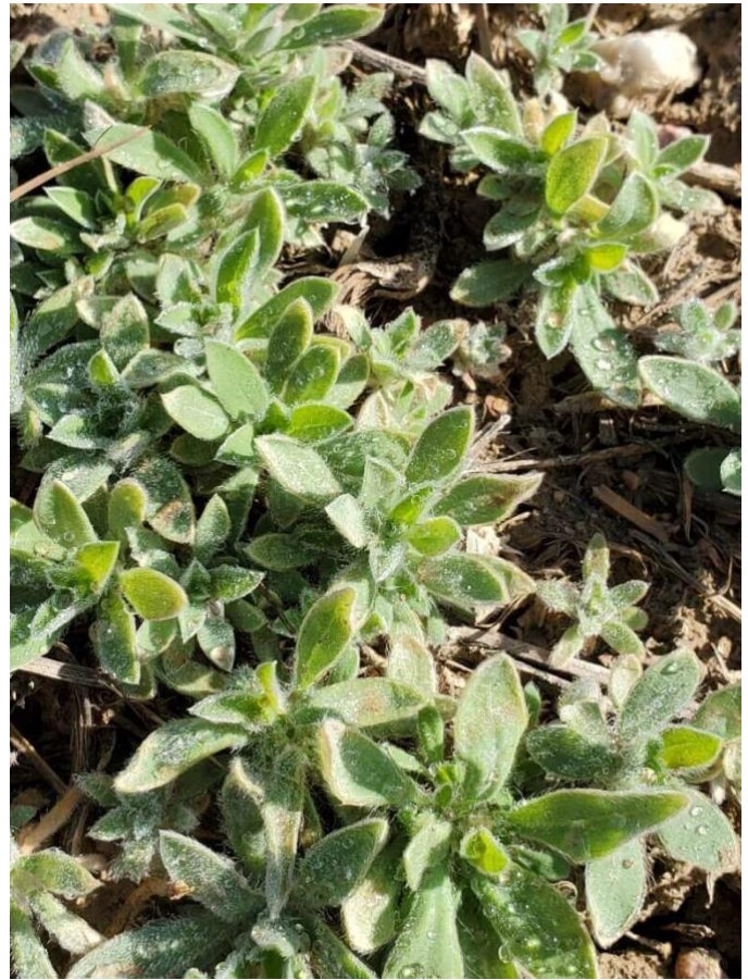
Kochia seedling density.

Around two weeks after seedling emergence, leaf hair density decreases as leaves grow. After the button stage, kochia leaves maintain fine leaf hairs on the bottom of the leaf, while leaf tops are smooth. It is common to see high seedling densities, especially around the location where the parent plant was growing before detaching from the soil when mature. This is often referred to as a “kochia mat.”