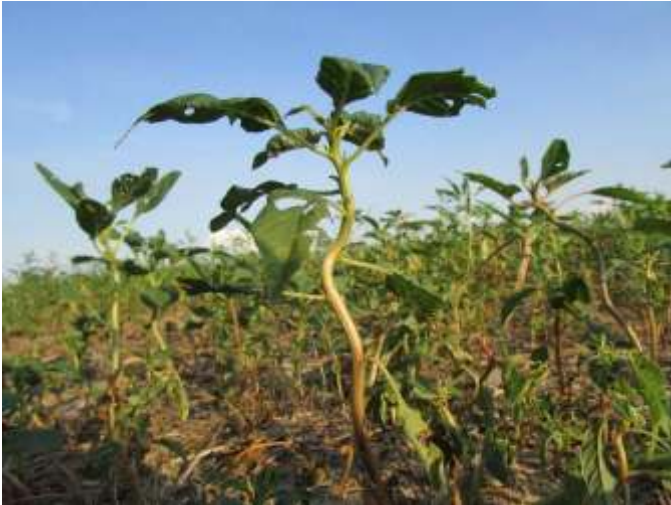
Exposure to sub-lethal rate of dicamba.

herbicides including ones that provide residual control. Preemergence or residual herbicides can protect crop yield by delaying waterhemp establishment early in the growing season.