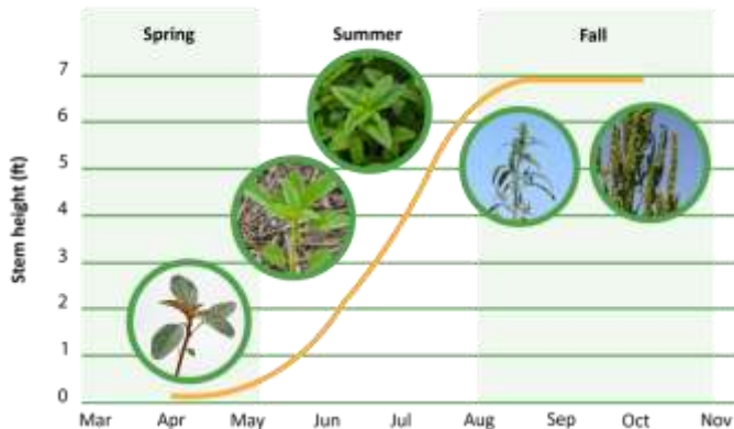
Figure 2. Figure 2. Waterhemp life cycle. These are approximate timings for southern Illinois. Timings will vary based upon location and resource availability. Figure adapted from Franca 2015.