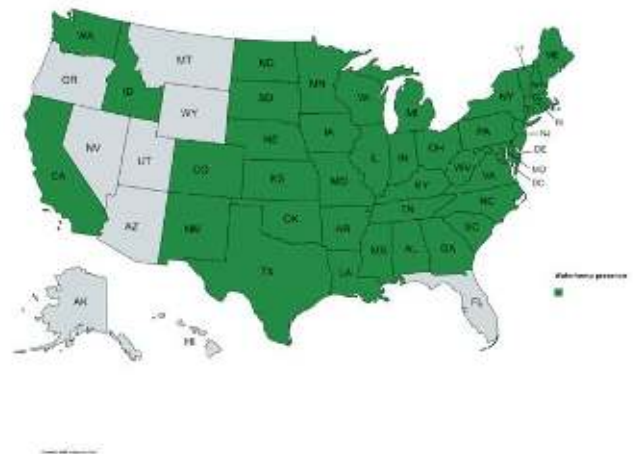
Figure 1. Green-shaded states have reported the presence of waterhemp as of 2020.

environmental conditions, preferring well-drained, nutrient rich soils, which are also preferred for crop cultivation. The plant tolerates a soil pH range of 4.5 to 8 and temporary flooding but has little tolerance for salinity.