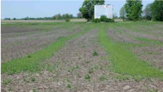
Waterhemp seeds spread by a combine.

Mechanical weed control in the form of tillage or cultivation may be an effective method of control if done timely. Primary tillage can control seedlings. Strategic (or occasional) moldboard plowing can be used to bury seeds beyond the germination zone. Seeds need to emerge from near the soil surface; the hypocotyl can only elongate up to 1.4 inches. Moldboard plowing can place the seeds deeper than this and prevent seedling emergence. Cultivation is very effective, but only on small seedlings. Mature plants may re-root, making cultivation ineffective.