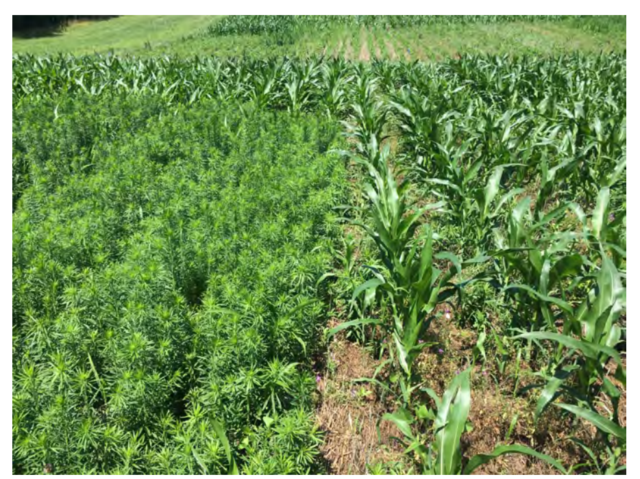
Figure 3. Comparison of horseweed populations between a no cover plot and a cover crop mixture of cereal rye and hairy vetch.