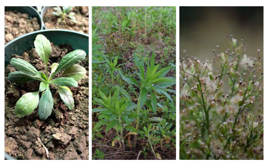
Figure 1. Horseweed across various growth stages. Left to right: rosette, bolt, and flowering.

Horseweed (Conyza canadensis), also known as marestail, is a very widespread and problematic weed in Virginia crop production. Yield loss from horseweed of up to 46% has been reported in cotton with a density of 20 to 25 plants m<sup>-2</sup> (Steckel and Gwathmey 2009). Horseweed can produce up to 200,000 seeds per plant, which are winddispersed, allowing for long distance dispersal between fields and across farms (Andersen 1993; Bhowmik and Bekech 1993). This