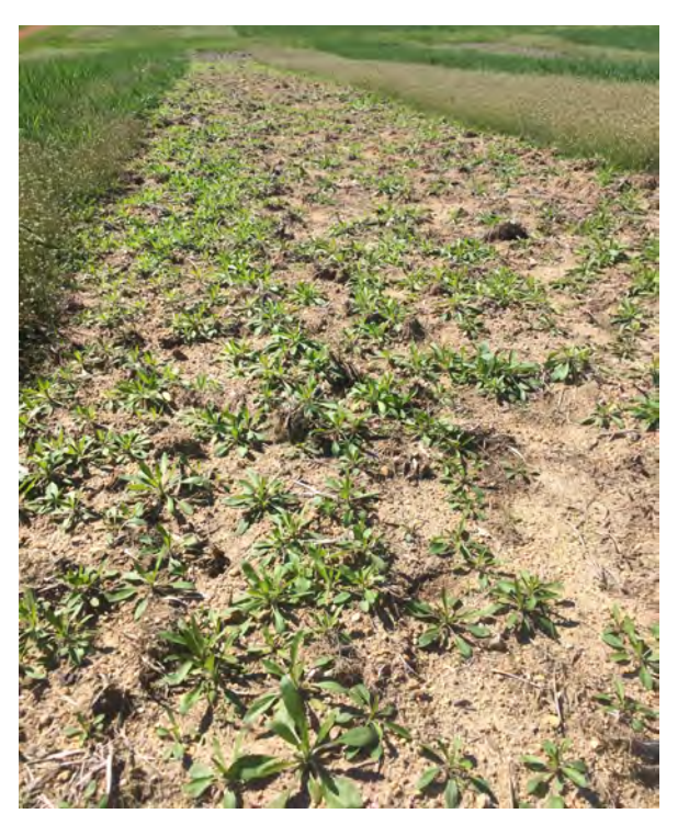
Figure 5. Fall-applied residual herbicides, like Canopy (metribuzin + chlorimuron) shown here, can decrease winter annual weed pressure and reduce the competition for resources allowing horseweed to germinate and grow unchecked.

Our research shows that cover crops can be used as a weed management tactic to suppress