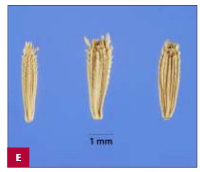
Figure 1. A) Rush skeletonweed rosette (Utah State University Archive, Utah State University, UGA 1459571; B) stem and downward-pointing hairs (Richard Old, XID Services, Inc., UGA 5230051); C) plant (Eric Coombs, Oregon Department of Agriculture, UGA 5435900); D) flower, fruit (Steve Dewey, Utah State University, UGA 1459575); and E) seeds (Steve Hurst, USDA NRCS Plants Database, UGA 5306099).

along the stem and at branch tips, either as single flower heads or in 2–5-head clusters. Each flower head has 9–12 ligulate (strap-shaped) florets that resemble petals. Each floret has small teeth across its blunt tip. The fruits of rush skeletonweed are achenes (seeds) that are about ^{1}/_{8} inch (3 mm) long and ribbed, and turn a dark brown or olive-green when mature (Fig. 1E). The seeds look very similar to those of the dandelion with each having a white pappus attached to a short stalk (Fig. 1D), enabling them to be dispersed by the wind.