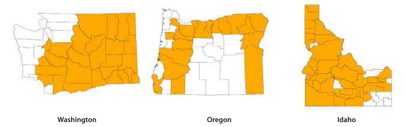
Figure 3. Distribution of rush skeletonweed in the Pacific Northwest states of Washington, Oregon, and Idaho in 2010. (Maps courtesy of the USDA-NRCS Plants Database, updated with current survey information from Greg Haubrich, Washington State Department of Agriculture; Eric Coombs, Oregon State Department of Agriculture; and Stephen Cox, Idaho State Department of Agriculture.)

Once rush skeletonweed is well established, it is nearly impossible to eradicate due to its prolific seed production and far-reaching dispersal capabilities, as well as its deep, extensive root system and regenerative capabilities. Successful management of well-established populations of rush skeletonweed requires a sustained and integrated approach using an arsenal of control methods and regular evaluation. The optimal combination and timing of control methods depends on various attributes of the infested area such as size, location, age, density, terrain, soil type, climate, and plant community. After the infested community is inventoried and mapped, a management plan that integrates appropriate control methods (see Table 2) can be determined and set in motion. The highest priority management objectives should be to prevent seed production and frequently monitor for new rush skeletonweed plants to enable rapid and effective response.