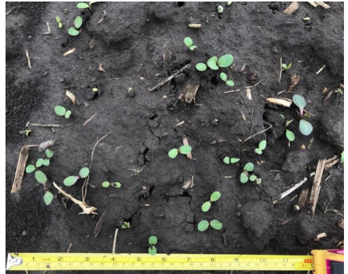
Emerging giant ragweed seedlings.

There are two giant ragweed biotypes with distinct emergence patterns. Giant ragweed populations found in western Iowa, Minnesota, and Nebraska tend to emerge from March to June with 90% emergence predicted by mid-May (short emergence window). On the other hand, populations found in Illinois, Indiana, Ohio, and Wisconsin continue to emerge later into the growing season (extended emergence window). In fields where the biotype with the extended emergence window is present, giant ragweed is particularly difficult to control and can require several sequential herbicide applications. Giant ragweed’s large seed size allows it to emerge from deep in the soil and emergence is often stimulated by tillage.