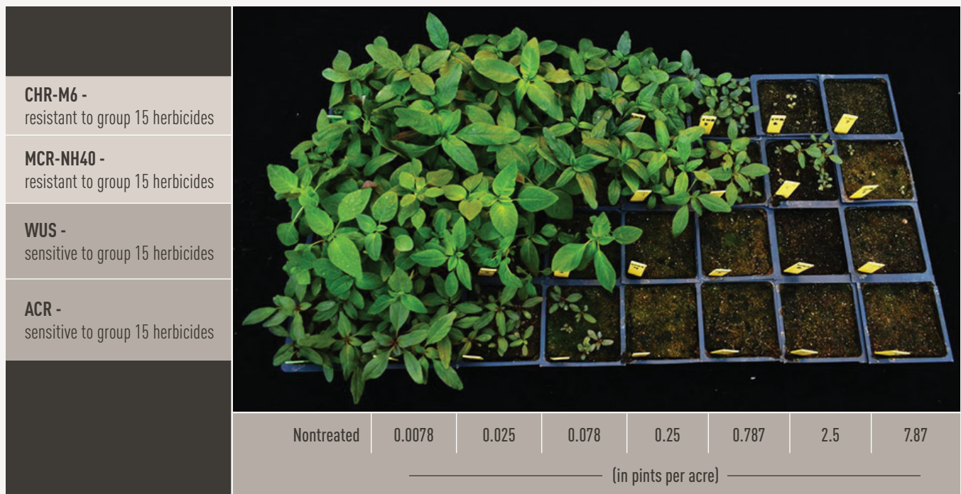
Figure 2. Dose-response experiment with four waterhemp populations treated with soil-applied S-metolachlor (Dual Magnum). Recommended rate for soil used in this experiment is 2.5 pints per acre.