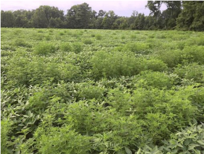
Soybean field infested with common ragweed.