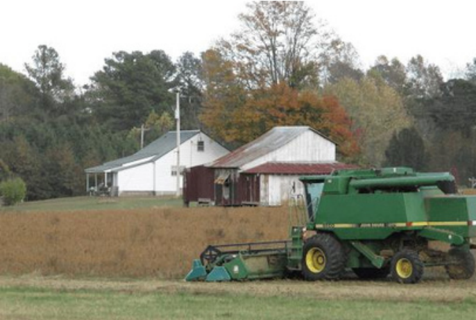
Combine harvesting a soybean field infested with common ragweed (darker spots). Equipment can easily spread common ragweed seed.

difficult to completely eradicate common ragweed because field edges and roadsides provide a refuge for later reinfestation.